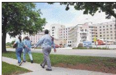
CURRENT St. John's Hospital, as seen from Cherokee Street, is in the middle of a long-term construction plan.