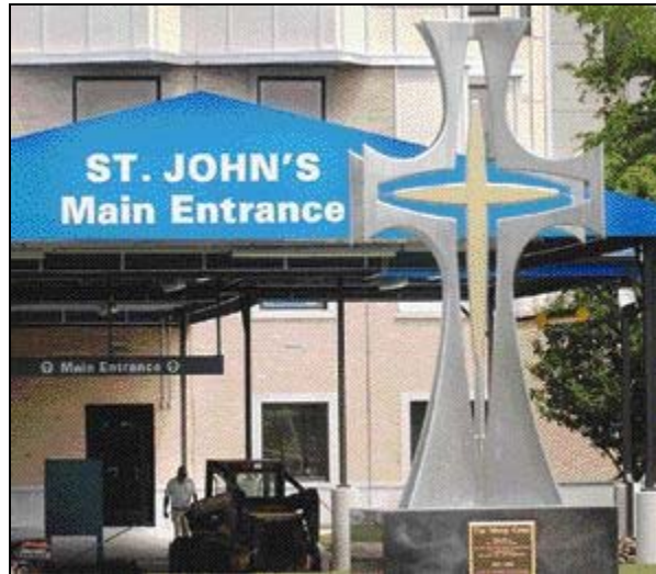
The Mercy Cross, dedicated to the Sisters of Mercy, has been relocated to the temporary entrance on the hospital's east side, which will be in use as of today.

St. John's master plan includes the new Emergency Trauma and Imaging Center, which opened Feb. 1; St. John's Surgery Center, which opened last year; a three-story multi-specialty clinic in Nixa, which opened May 2; improvements to St. John's Clinic-Smith Glynn Callaway south of the main campus; St. John's Radiosurgery Center, featuring the non-invasive CyberKnife, set to open this summer; a 20,000-square-foot addition to St. John's Sports Medicine & Physical Therapy building, which will begin opening with outpatient physical therapy this summer with total completion this fall; and a loop road connecting new and existing St. John's facilities on the main campus.