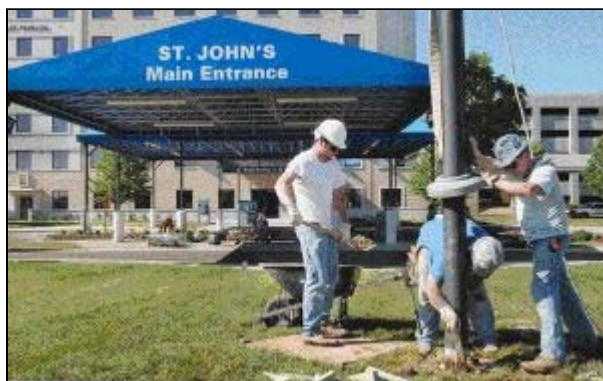
Construction workers from DeWitt and Associates relocate a flag pole to the temporary entrance at St John's Hospital. A flurry of activity was taking place to get the entrance ready for today.